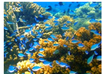
Blue Green Chromis