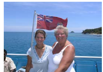
On the ferry out to Tokoriki